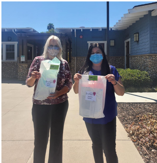
The Salvation Army's Door of Hope staff receiving the delivered Street Boutique orders.

We are happy to announce that our Street Boutique officially launched last month through our new Street Boutique website! To ensure that our guests continued to have the dignity of choice and safe access to essential items, our website was designed as an online retail store to allow residents at partnering homeless shelters and transitional housing programs to "shop" for brand new undergarments and a month's supply of menstrual hygiene items for free and have their items safely packaged and delivered straight to them from our staff!