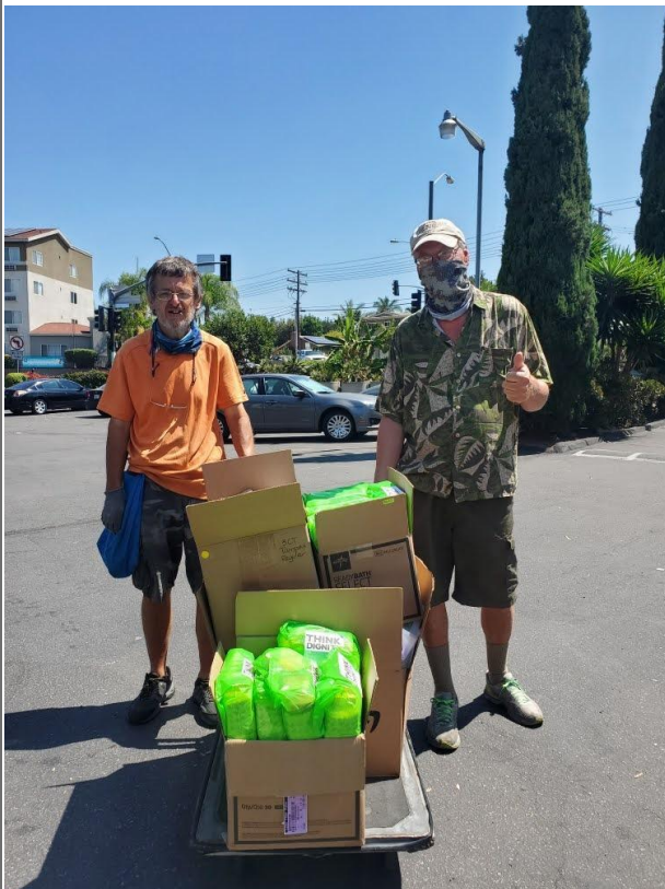
Our partners at Wesley Community Services Center preparing to distribute our Dignity Kits to their homeless

With your support, we surpassed our goal for creating and distributing 1,000 Dignity Kits! Your $25 sponsorship and in-kind donations have allowed us to create over 1,300 Dignity Kits, distribute 21,500+ hygiene items, and provide access to basic hygiene for homeless individuals throughout San Diego County! Moreover, your donations have allowed us to build more partnerships with homeless service providers and advocates and support communities that have historically been underserved.