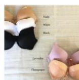
C Cup Bras