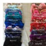
Bralettes: S/M Medium to