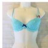
A Cup Bras $0.01