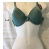
B Cup Bras $0.01