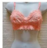
Bralettes XSmall $0.01