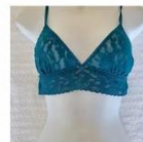
Bralettes Small $0.01